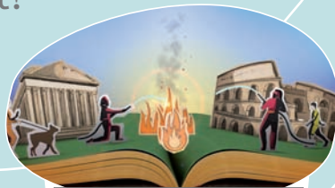
Firemen work together to put out a fire across the border