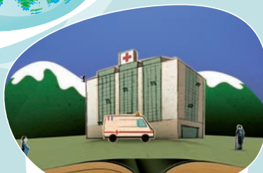
Neighbouring regions run a joint cross-border hospital