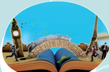
Two cities build a bridge to connect their citizens