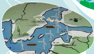
A European university network exchanges solutions for renewable energy